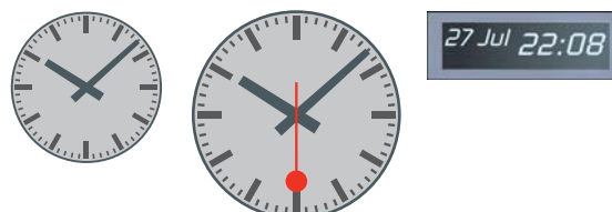
MOBALine Slave Clocks